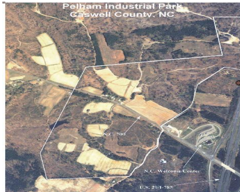
Figure 2 Pelham Business Park

In 2020 Caswell County granted Piedmont Community College 78.02 Acres for the construction of the Center for Educational and Agricultural Development (CEAD) . This Property is located on the south side of HWY 700. Once this campus is completed it will bring vendors and industry partners to the area from the triad area and beyond.